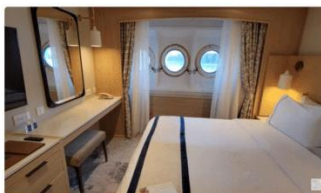
Cabin 307 Star Porthole Suite / Star Legend / Windstar Cruises