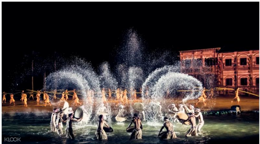
▲ Enjoy the largest real-world show featuring the mountains and bodies of water of Vietnam in an outdoor stage