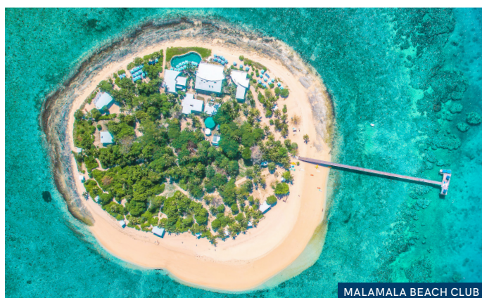
MALAMALA BEACH CLUB

Guests on our 4 Night itinerary can book their Malamala Day Pass on day that suits them either pre or post their cruise. This includes coach & vessel return transfers from most resorts and the FJ$50 per adult F&B voucher to use on the island.